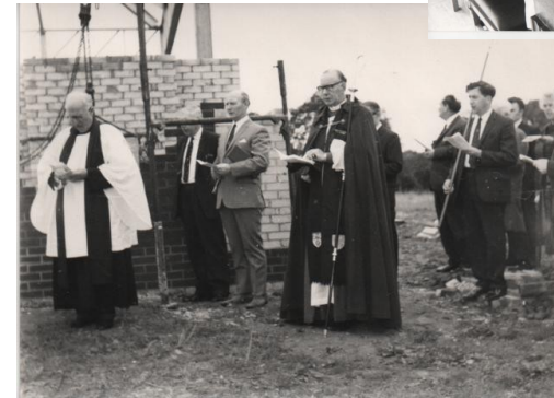
Laying the foundation-stone of the new church 21 September 1969 (left and below) .