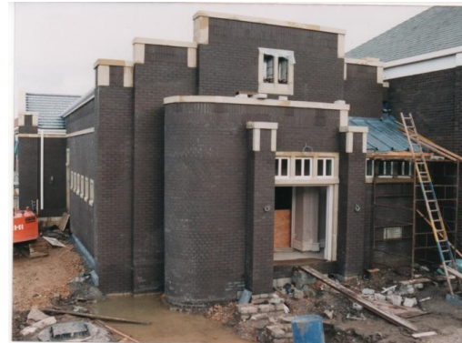
New church hall nearing completion 1997 (top).