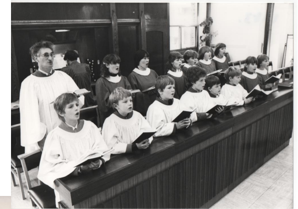
The church choir (1983) (right).

Saturday 1 April 1972 The new benefice of the Parish of St. Leonard, Penwortham is established; taken out of the ancient parish of St.