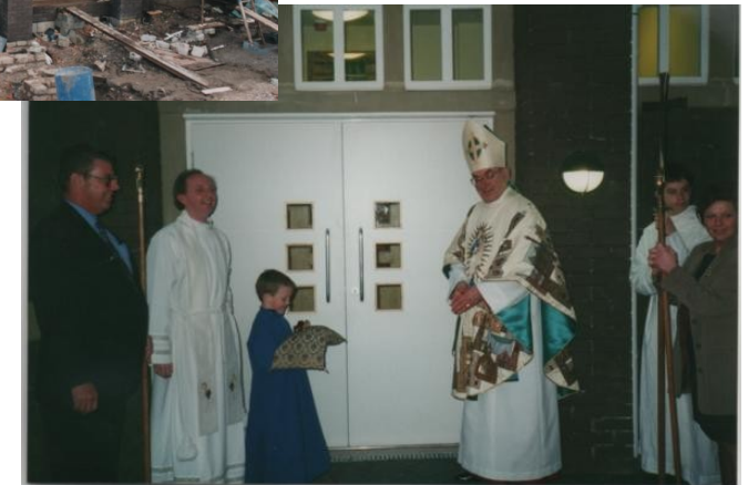
Laying the foundation stone of the new hall 14 July 1996 (below).