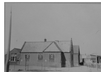
The chapel-school (left). Demolishing the 1861 chapel-school in 1975 (right).